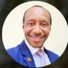
HON. JUSTICE STEPHEN GITHINJI, HIGH COURT JUDGE