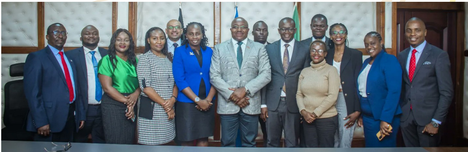
Council Members pose for a group photo with the Deputy Governor, Embu County

The County is also committed to paying the pending bills in installments. Both parties look forward to the local Chapter's involvement in review of the bills and assistance to fine tune them. The positive engagement marks the beginning of future developments.