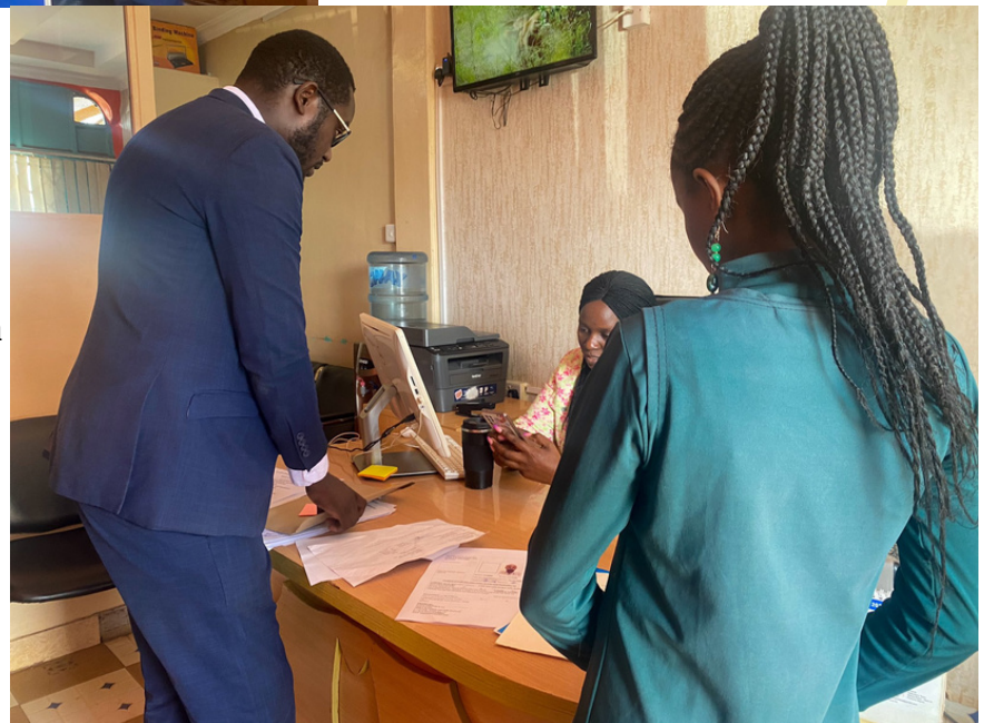
The Masquerader being nabbed at her office in Kenol, Murang'a County.