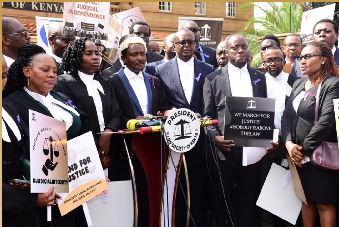
LSK Members at a Press briefing before the peaceful protest march.

Members of the Law Society of Kenya turned up in large numbers for the LSK Peaceful protest march dubbed #ConstitutionalSafeguards held on Friday 12th January 2024. The aim of the protest was to reaffirm our oath and the commitment of Advocates to defend the independence of the Judiciary, compliance with court orders and express our strong condemnation of the President's remarks undermining the independence of the Judiciary.