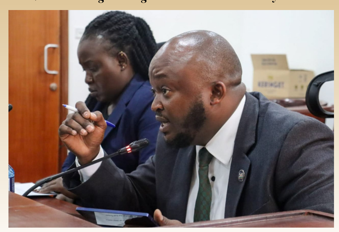
The VP expressing a point during the presentation.

The Committee chaired by Sen. Abass Mohammed appreciated the LSK for the submissions. Other committee members present were Sen. Oburu Odinga, Sen. Peris Tobiko, Sen. Karungo Thangwa and Sen. Richard Onyonka.