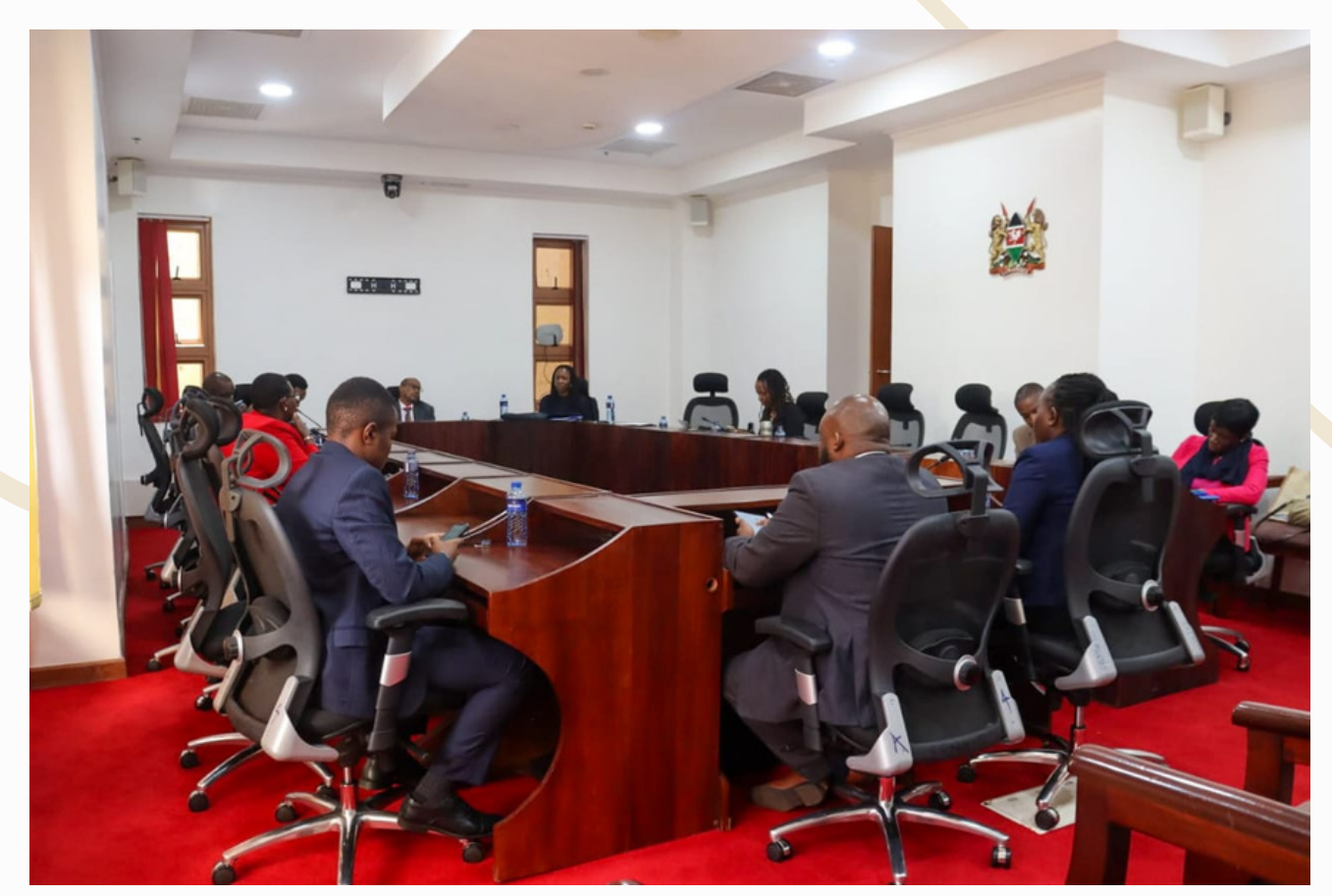
Members during the presentation of the Memorandum.