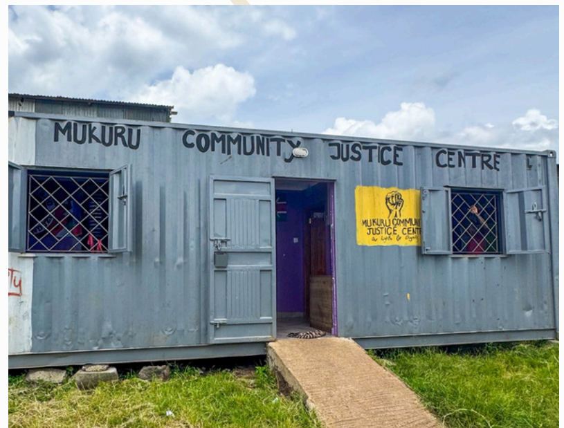
Advocates at the Mukuru Community Justice Centre.