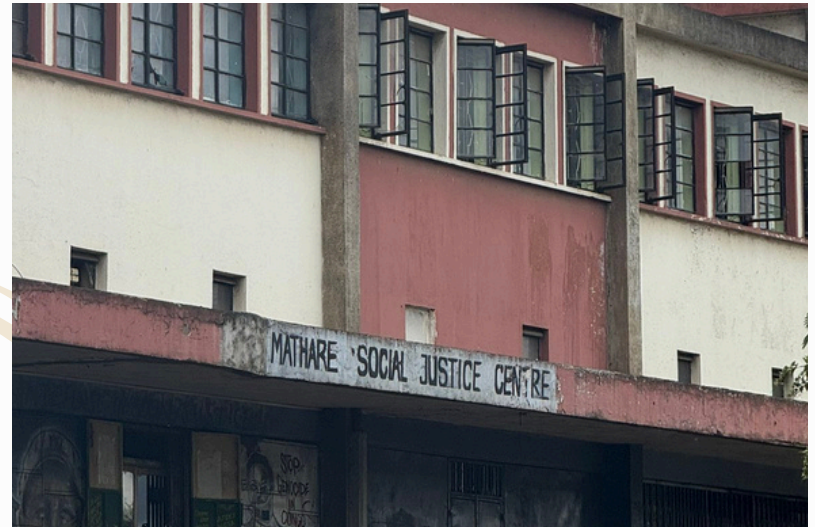
Advocates at the Mathare Social Justice Centre.